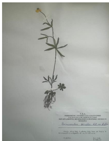
Figure 2. Ranunculus binatus – herbarized material (orig.).

Taxonomy. The material collected and analysed by the author does not exceed 30-40 cm in height; it has a thin stem that is branched at the top. The basal leaves display long petioles and variability in terms of incisions, being from palmately cleft to palmately divided (Fig. 2). The ones situated on upper stems show entire linear segments (Fig. 3). Achenes are pubescent.