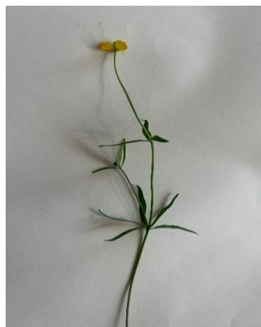
Figure 3. The upper part of the flowering stem of Ranunculus binatus (orig.).

Habitat and coenology. It is present in areas covered by grass, located in river meadows, on soils with water variability, from moist to humid. From a coenological point of view, most specialists place it in the Molinio-Arrhenatheretea R. Tx. 1937 class (POPESCU & SANDA, 1998; SÂRBU et al., 2013; PÎNZARU, 2021), which represents a viewpoint also supported by the author of the present paper. In other works, it is included in Querco-Fagetea BRAUN BLANQUET et VLEIGER in VLEIGER 1937 (POPESCU & SANDA, 1998; SÂRBU et al., 2013), or in Carpinion betuli ISSLER 1931 (COSTACHE, 2005).