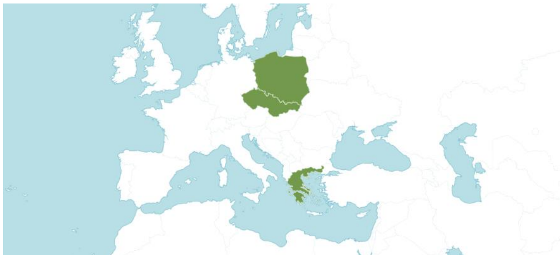
Figure 1. Distribution of the species Ranunculus binatus green – native ( https://powo.science.kew.org/taxon/urn:lsid:ipni.org:names:712309-1 ).

Ranunculus binatus Kitaibel ex Reichenbach 1832 is mentioned as a native species in Central and South-Eastern Europe: Slovakia, Poland, and Greece (POWO, 2023) (Fig. 1). A few years ago, it was also identified in the flora of the Republic of Moldova (PÎNZARU, 2019) and it was subsequently mentioned as a rare species (PÎNZARU et al., 2021; PÎNZARU, 2023).